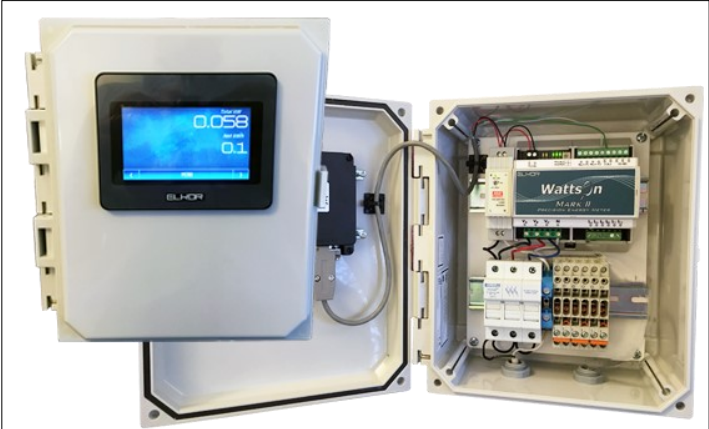
W2KIT-S (-DL suffix — internal display only)