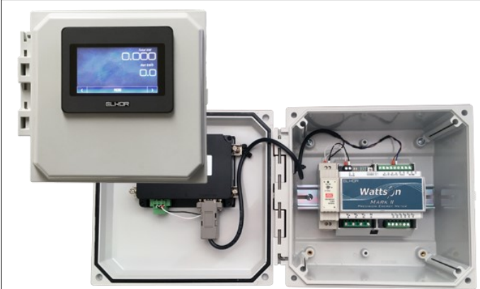
W2KIT-S (external touchscreen color HMI)