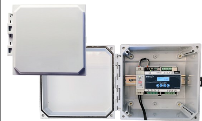
W2KIT-S (-DL suffix — internal display only)